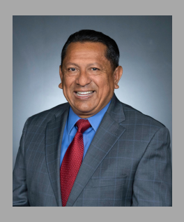
Yohalmo Saravia Hispanic Ministries